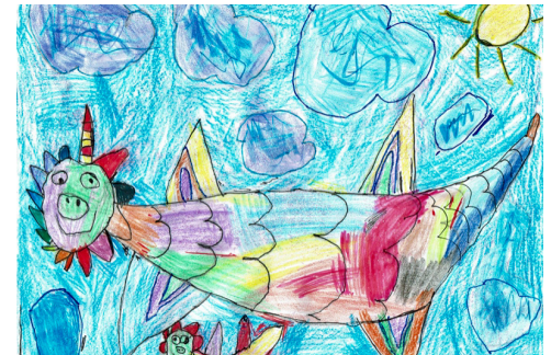
Coralie's second dragon drawing.