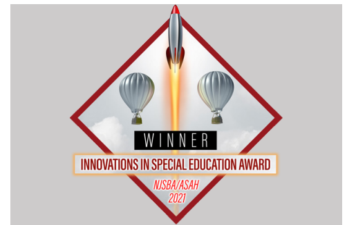
NJSBA presented the district with the award.

The district is thrilled to announce that our College and Careers for All program has received the 2021 Innovations in Special Education Award from New Jersey School Boards Association. We are very proud of this wonderful program as well as the students and staff who have made the program an incredible success!