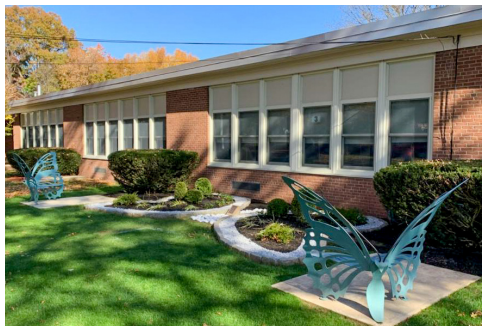
The garden graces the front of Hoover School.