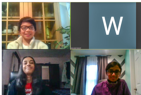
The winners are congratulated on a Zoom call.