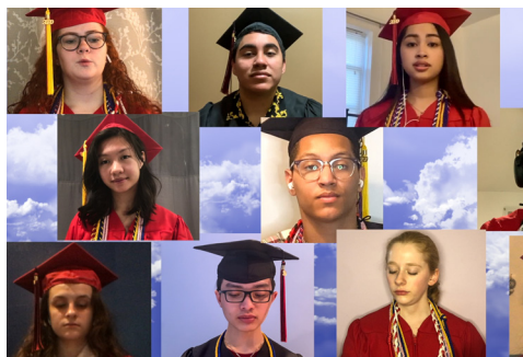
A snippet from the virtual ensemble.

The BHS Music Department's Class of 2020 "Sing to Me" virtual ensemble, which was aired during last year's virtual graduation ceremony, was selected for the Arts Education Showcase at this fall's New Jersey School Board Association Workshop. The video serves as a wonderful example of the many possibilities that exist for student learning and collaborative performances in the arts during this challenging time.