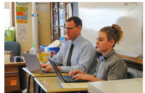
The duo conducts a teacher observation.