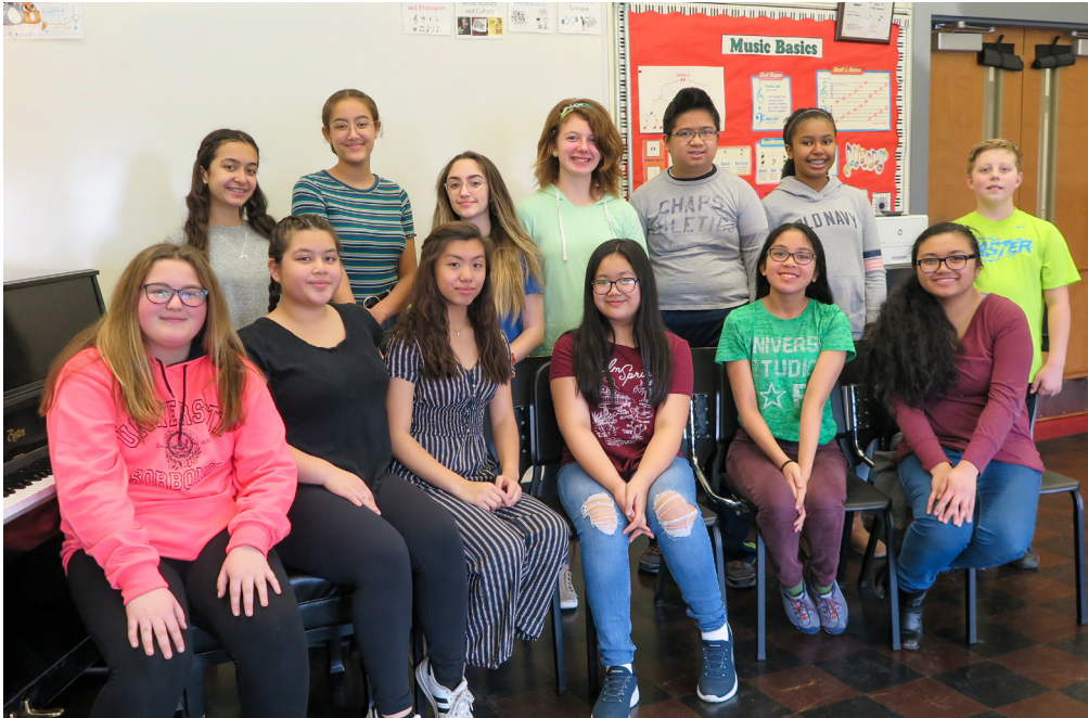
RWB had a strong showing at the Junior Region Choir performance this month.

Fourteen 7th and 8th grade choir students from Roy W. Brown were accepted into the 2019 Junior Region Choir. Their performance was on Sunday, March 17th at Mountain Lakes High School.