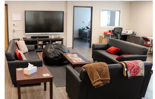
Living room space equipped with SmartBoard.