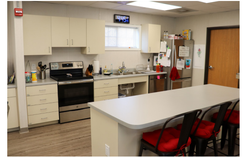
Modern kitchen is used to prepare meals daily.

The juried YAM Exhibition is considered one of the most prestigious art competitions of the year.