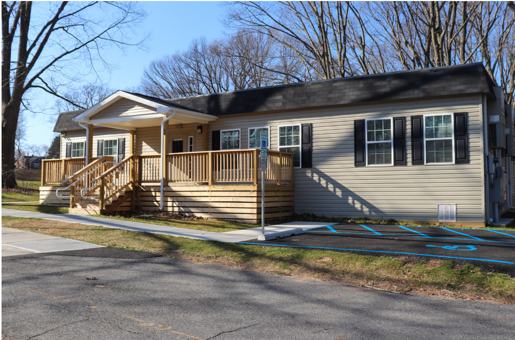
Exterior shot of the newly constructed Bear Den.

In January, board members, staff, students, and borough officials attended a ribbon-cutting ceremony at the Bear Den at Lincoln Elementary School.