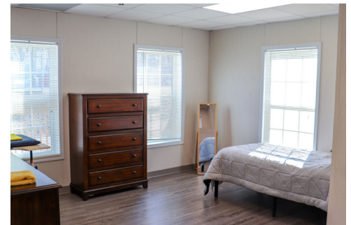
Bedroom space further supports life skill training.